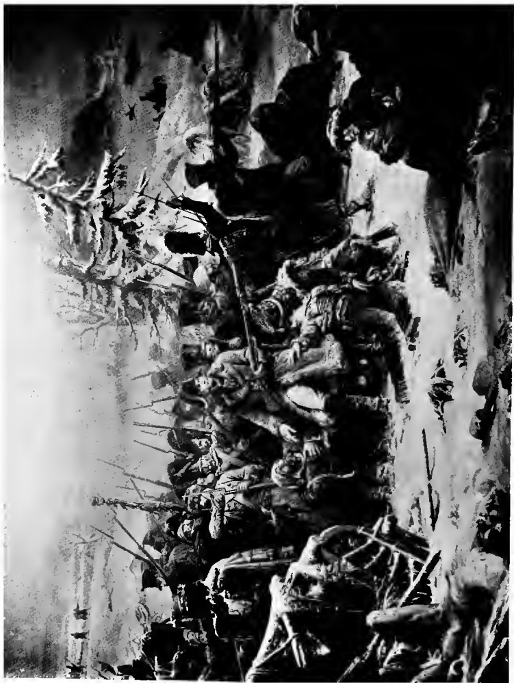
MARSHAL NEY COVERING THE RETREAT, 1812